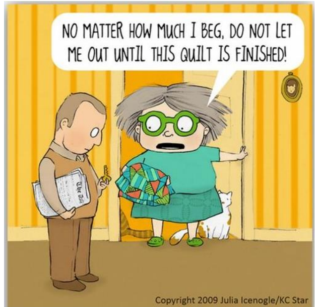
Quilt Show Panic, Stage 2: The All-Nighter